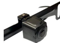
LICENSE PLATE MOUNT