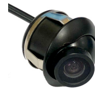
ADJUSTABLE ANGLE PUSH IN MOUNT HOUSING