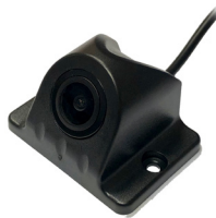
LIP MOUNT HOUSING