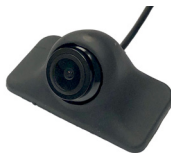
RUBBER STICK-ON MOUNT HOUSING