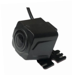
SQUARE MOUNT HOUSING